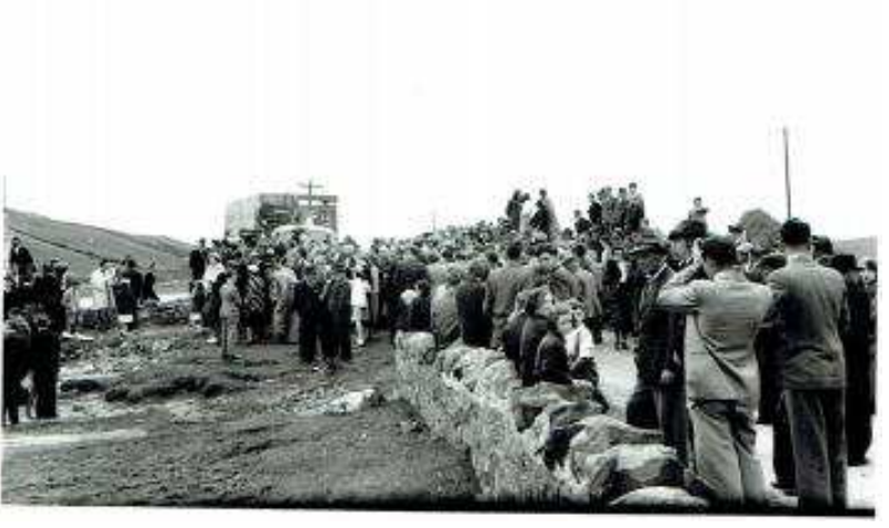
Some of the Large Crowd of O'Malleys in 1953