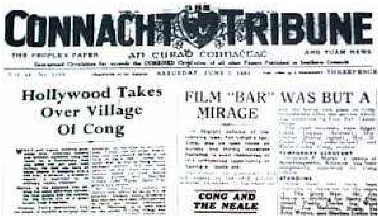
The Connacht Tribune (Above), and the 1918 election results, (Below)