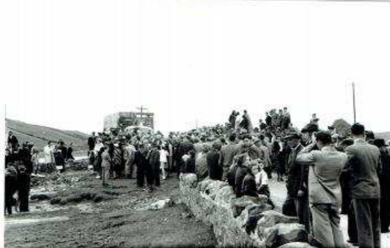
Some of the Large Crowd of O'Malleys in 1953