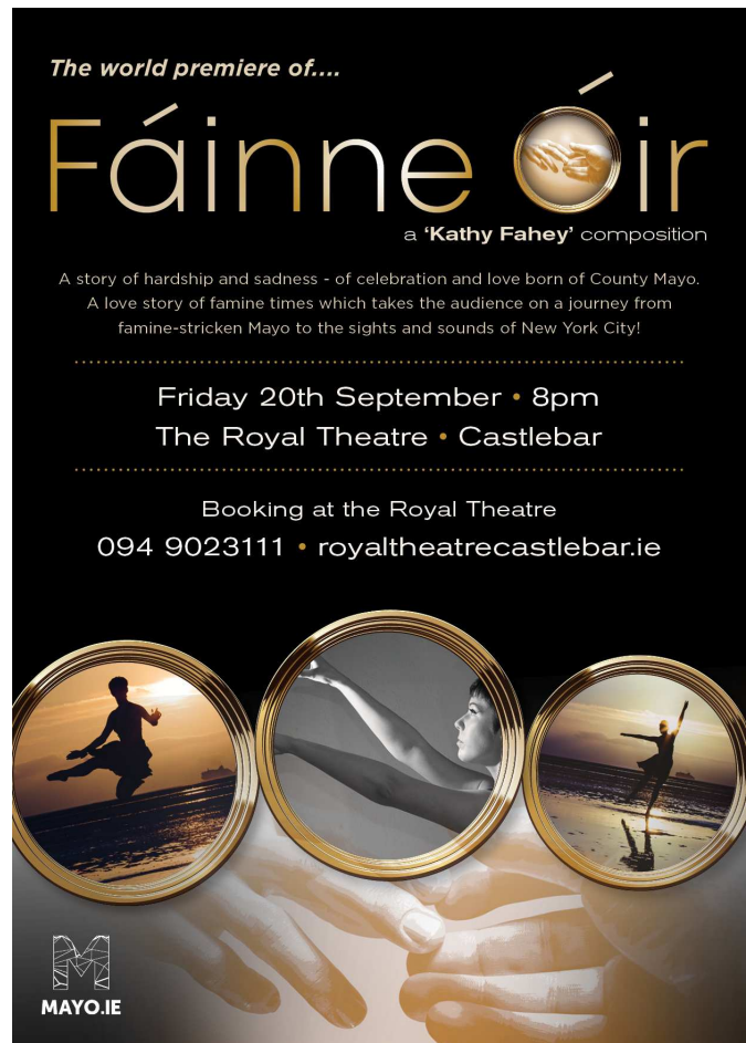
Below: A capture of some of the action on stage