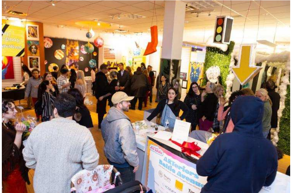
Above: People gather to check out “Arteriors” in Atlantic City.

Tanger Outlets in Atlantic City is home to lots of fun-to-stop-at venues — stores like Banana Republic Factory, Coach and J. Crew Factory, as well as eateries like Wingcraft and Applebee’s. And while it’s a great place to get your shop on, the newest addition to Tanger Outlets in Atlantic City isn’t a store at all — it’s a pop-up art installation.